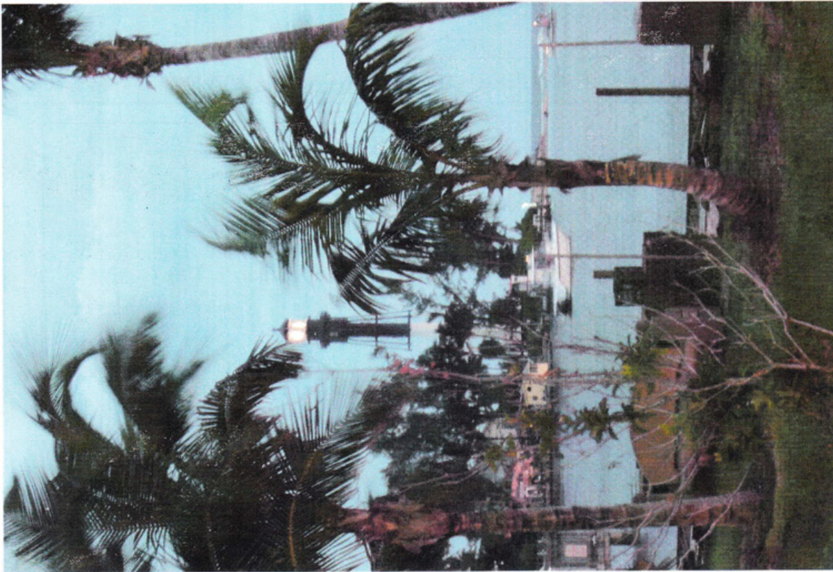
On Florida Lighthouse Day

The mission of the Hillsboro Lighthouse Preservation Society, Inc., "HLPS" is to promote the history of the Hillsboro Light Station and the Hillsboro Inlet area through preservation of structures and artifacts, education, and public access tours.