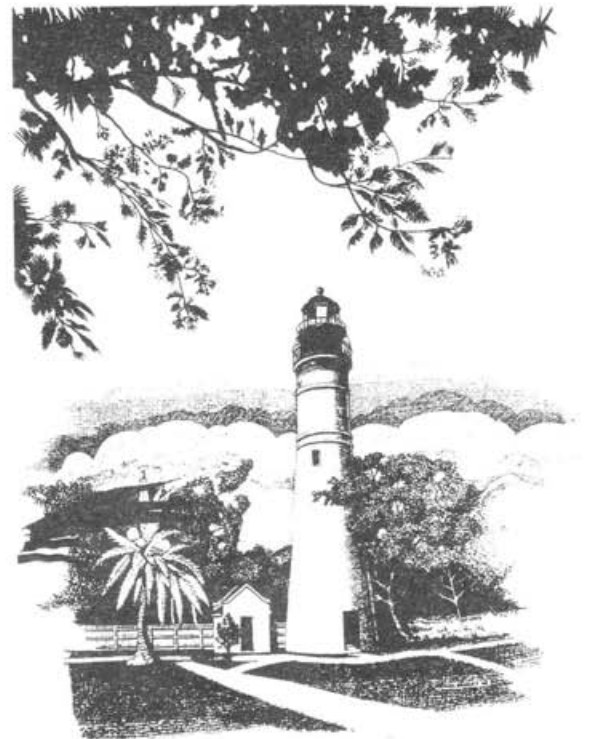
KEY WEST FLA.

The British pioneered in the development of iron Lighthouses for use on exposed ocean locations. The first American iron tower off Boston collapsed after only 18 months service. But we persisted, and in March 1852 the first "screwpile" Lighthouse was erected in