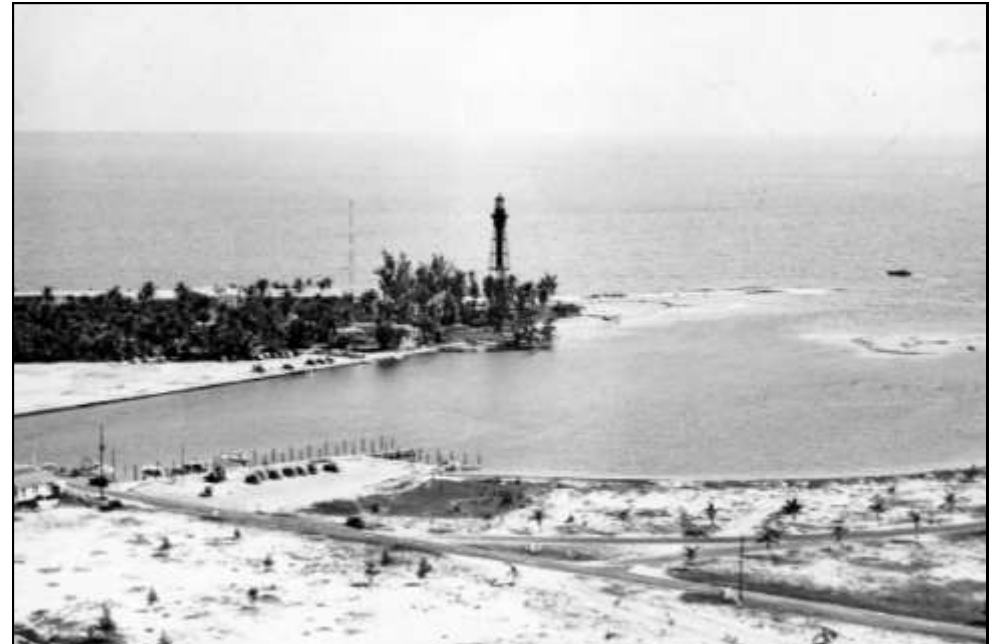
Inlet shores 1942

on Hillsboro Shore reefs, and the crew was captured by the Navy and the Coast Guard residing at the lighthouse. Also another story was that the German U-Boat Crew was captured while attempting to kidnap Sir Anthony Eden then The British Foreign Secretary visiting Hillsboro Beach. Eventually, by early 1944, all German war vessels were sunk and destroyed by the U.S. Army Air Force and the U.S. Navy. Only few managed to sail back to European shores.