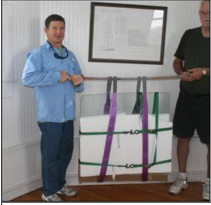
First glass pane 5-16 thick, 32.5X32.5, 30lbs

volunteers did just that. The last glass pane was installed on the 29<sup>th</sup> of April 2015, a full month ahead of schedule.