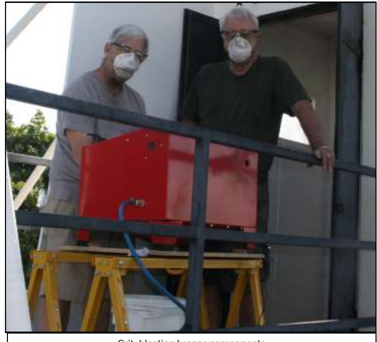
Grit blasting bronze components

The first glass pane was removed and replaced on the 20<sup>th</sup> of January 2015. While planning for this project HLPS advised the Coast Guard Aids to Navigation office that the nightly light operation would not be interrupted during the entire project. The glass panes had to be removed after dawn and installed before dusk. The classic lens had to be protected during the entire working hours in the lantern room. HLPS