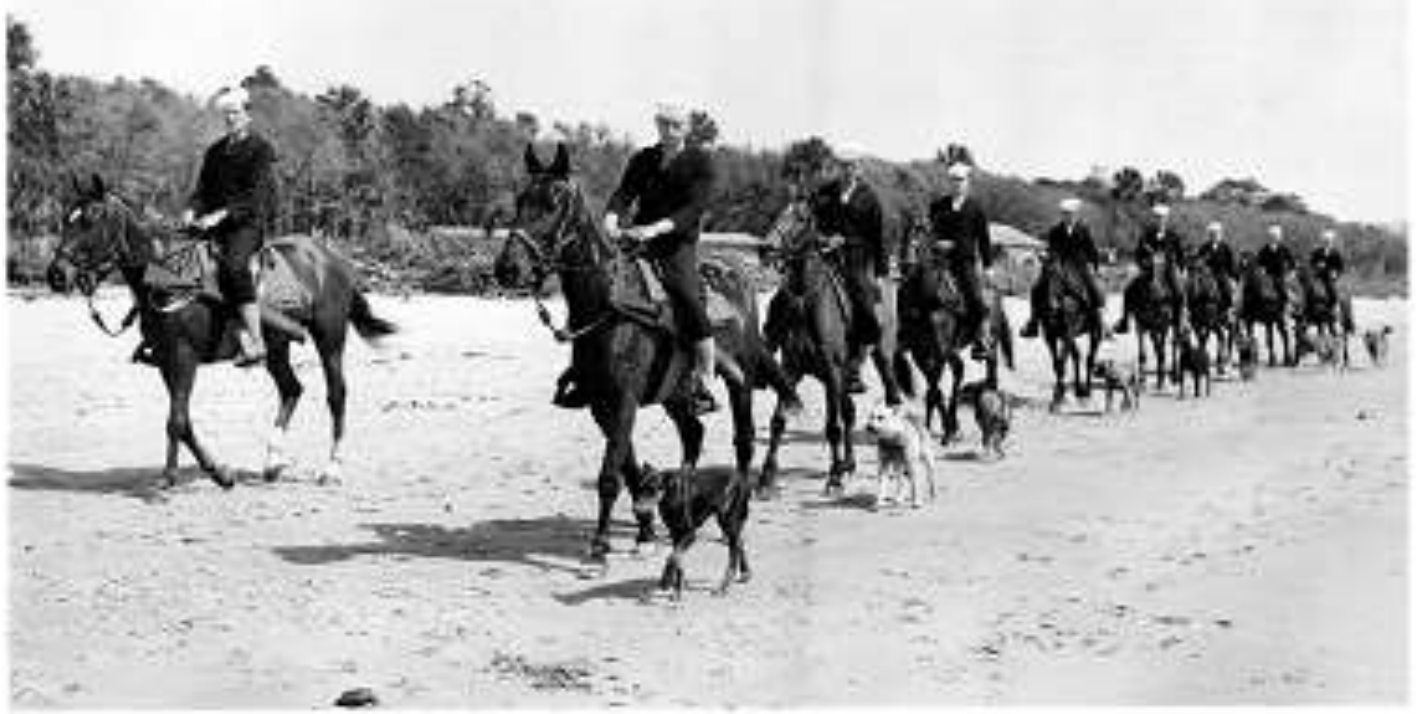
Beach Patrol 1943

The Coast Guard never used mounted patrols again, but this unusual part of the service's history illustrates its unending flexibility and adaptability, and is a shining example of how the Coast Guard continuously lives up to its motto.