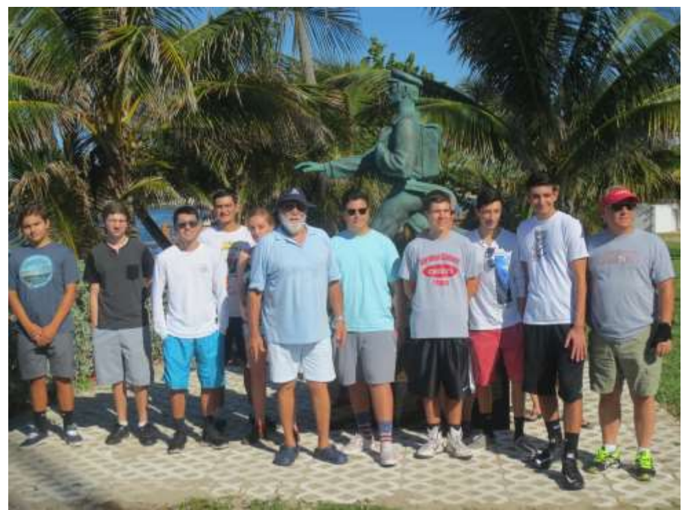
Cardinal Gibbons Students at Hillsboro Lighthouse