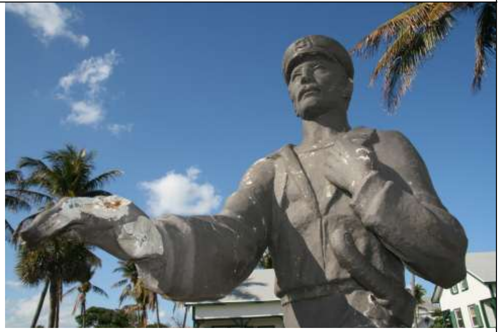
The damaged Barefoot Mailman statue at Hillsboro Inlet Light Station