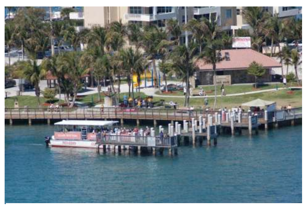
Visitors to the Inlet Station Boarding the Boat at Hillsboro Inlet Park

For more information about upcoming HLPS events and for information on purchasing a commemorative Centennial Patio brick, please visit the HLPS Web site at www.hillsborolighthouse.org.