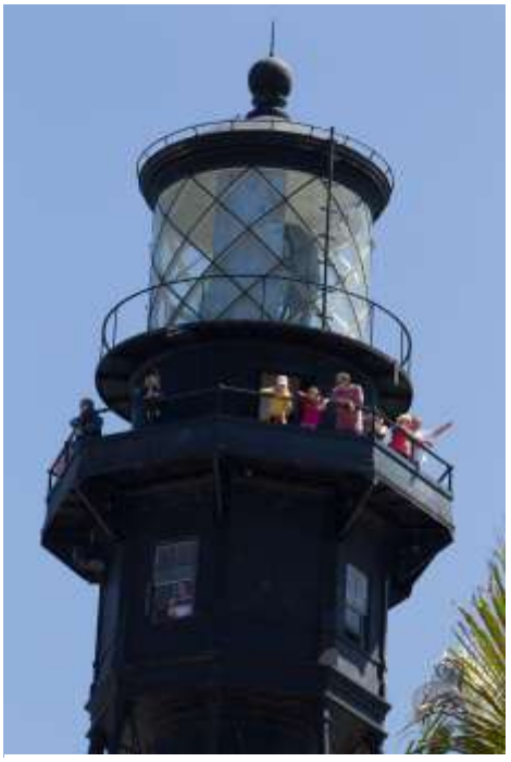
Tour Visitors at the top of "Big Diamond"