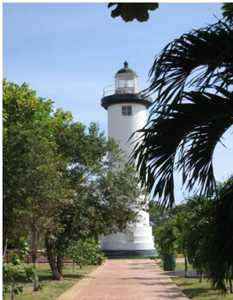
El Faro de Punta Higüero en Rincón

Rincon - The first Rincon (Punta Higüero) lighthouse, ultimately demolished in 1931,