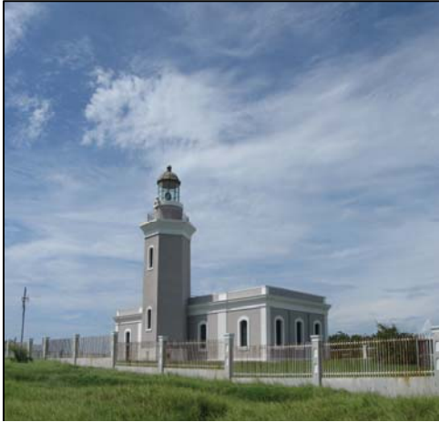
Cabo Rojo Lighthouse

southwestern tip of Puerto Rico. The lighthouse is located over a white lime