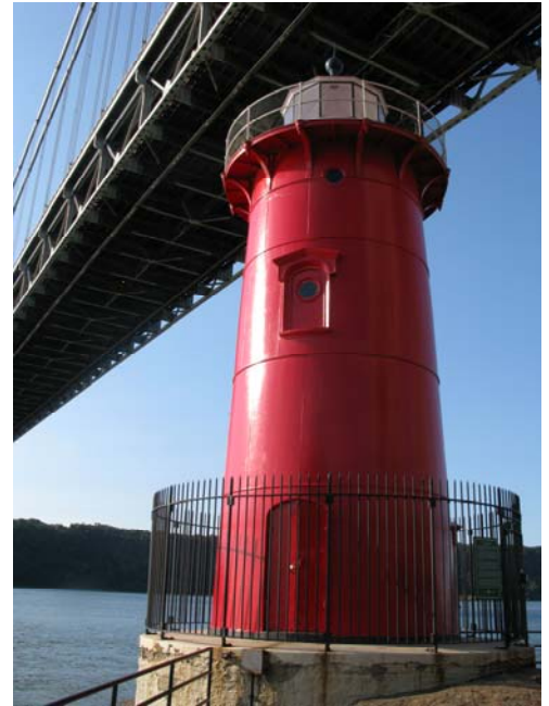
Jeffrey's Hook Light

On your next visit to New York City, consider taking a tour of the Jeffrey's Hook Lighthouse, also called The Little Red Lighthouse in Fort Washington Park. For tour information, call (212) 304-2365. The Little Red Lighthouse and the Great Gray Bridge is available at Amazon.com and BarnesandNoble.com.