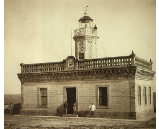
Guanica circa 1898

“Before the new lighthouse could be built, a 7.5 magnitude earthquake severely damaged the lighthouse”