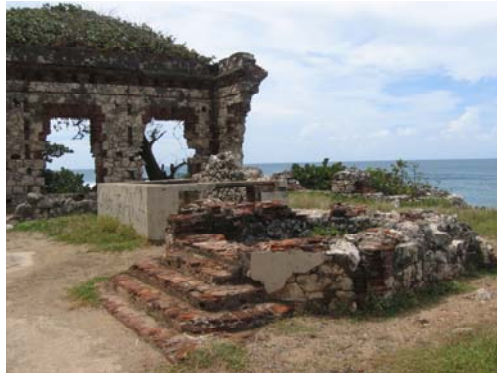
Punta Borinquen Ruins (Las Ruinas)

only as guest housing for Coast Guard personnel. However, the original lighthouse ruins are accessible via a paved road that crosses through the Punta Borinquen Golf Course.