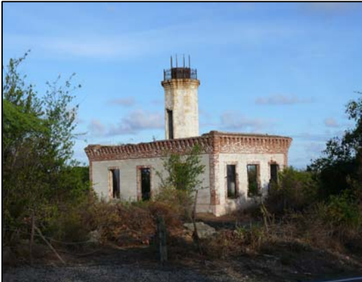
Guanica Lighthouse Ruins

In 1869, the Spanish government approved plans to build lighthouses at strategic points along Puerto Rico's coastline, not only for the safety of international ships delivering goods to Puerto Rico, but for the local ships that transported goods between the ports of Puerto Rico along the 311 miles of volcanic and plutonic rock that makes up her jagged coastline. Thirty years later, the newly sovereign government installed after the Spanish-American war