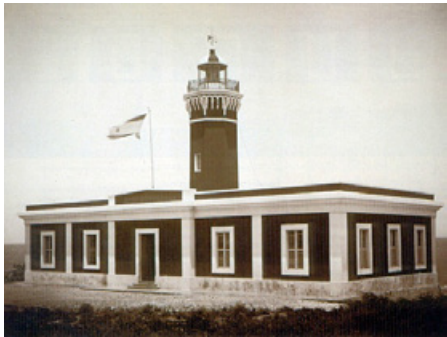
The Original Lighthouse at Punta Borinquen c. 1895