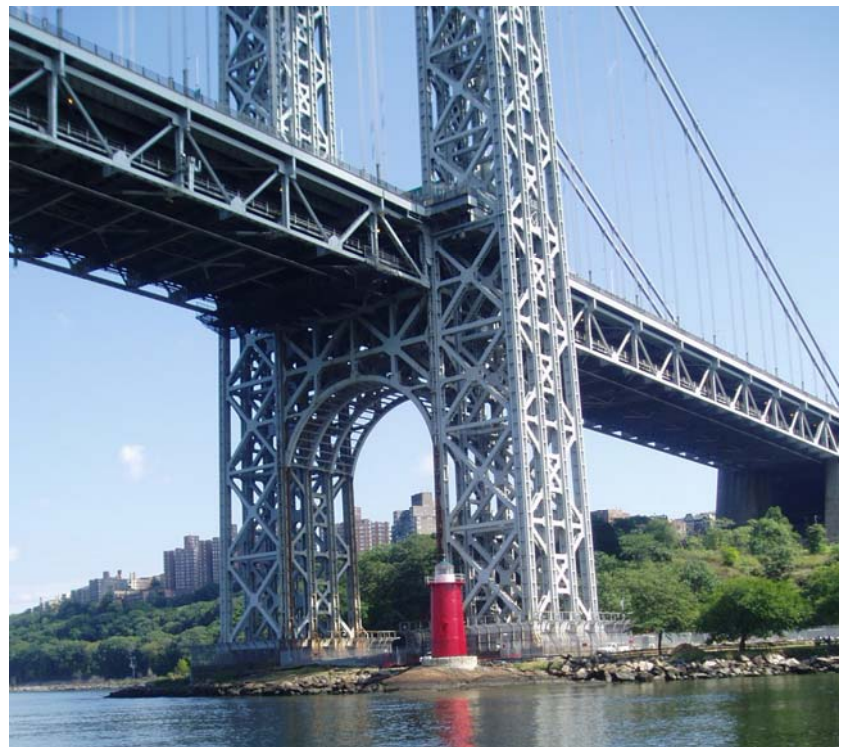
The Little Red Lighthouse and Great Grey Bridge