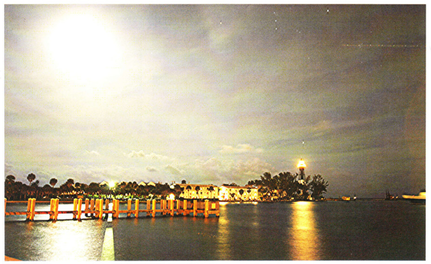
"Hillsboro Inlet Light Station at Full Moon"

Hillsboro Lighthouse Preservation Society, Inc. (New) P. O. Box 610326, Pompano Beach, FL 33061-0326