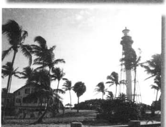
Lightouse Tour Photos by Dave Noderer.