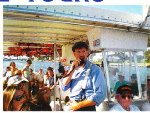
On Saturdays, January 24th and March 21st,

PS volunteers, Coast Guard and local Coast Guard Auxiliary members will welcome you to the Hillsboro Lighthouse Station via our chartered 49 passenger shuttle boat. Come yourselves and invite friends and neighbors to join our Society that day at tables set up at the north dock of Sands Harbor Hotel on the Intracoastal Waterway at 125 N. Riverside Drive directly across the street from the Pompano Beach City Parking Lot where your car should be parked. There is a parking fee of $1.00 an hour (estimate 3 hours for the tour, more if bringing a picnic lunch). A one year membership is $25.00 for an individual, $35.00 for a family or $50.00 for an organization or business. These memberships allow you to attend any tours or activities for a full 12 month's year with no additional fees except for any meals or very special activities.