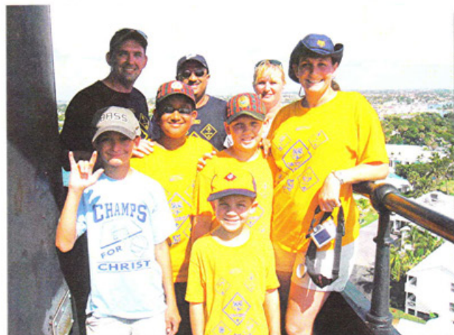
Scouts & parents at the top