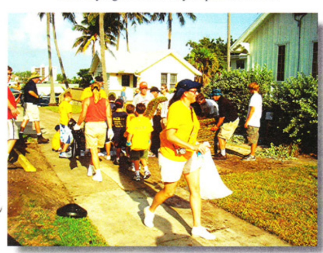
Volunteers Arborist Day September 15th.