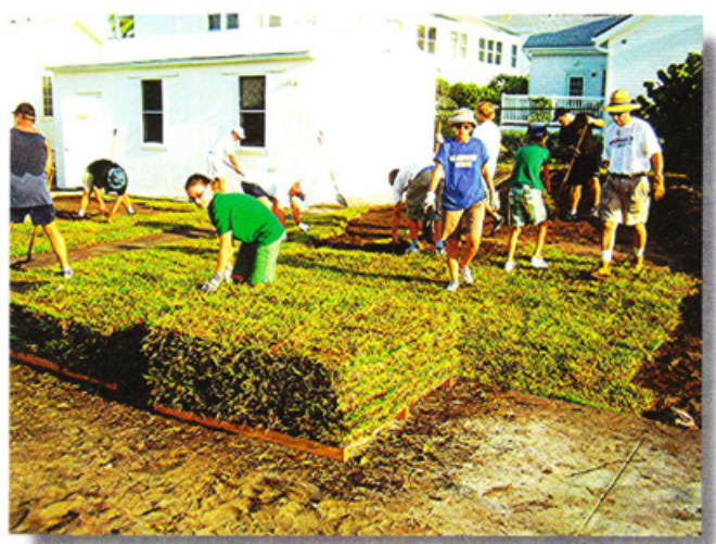
More Sod Laying Arborist Day September 15th.