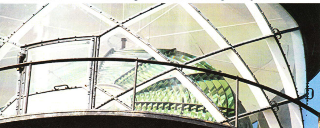
First lit March 7, 1907