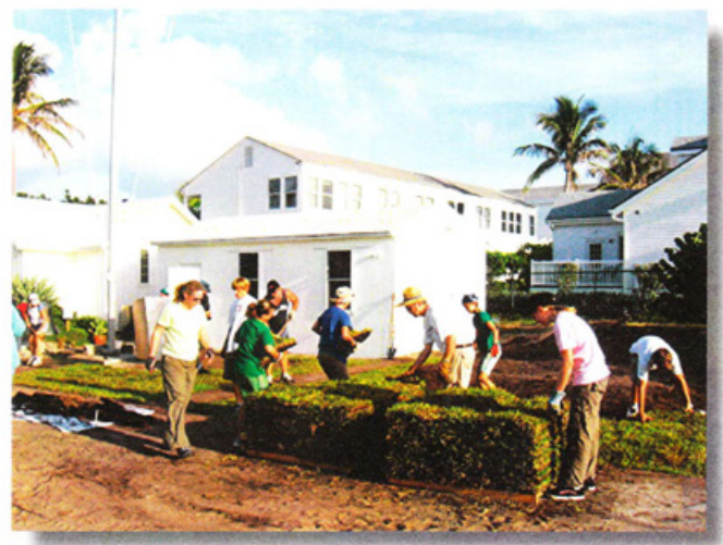
Sod Laying Arborist Day September 15th.