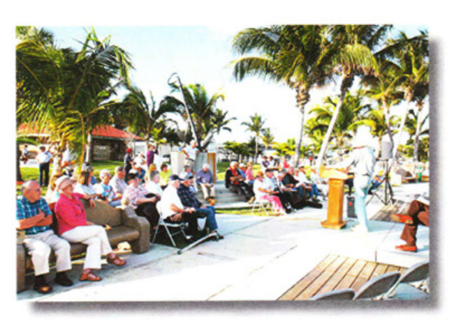
Centennial celebration at Inlet Park.