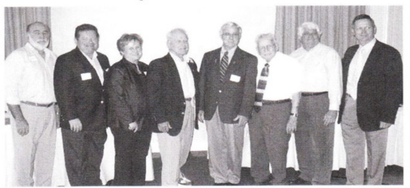
Part of the Board poses for picture before the annual meeting