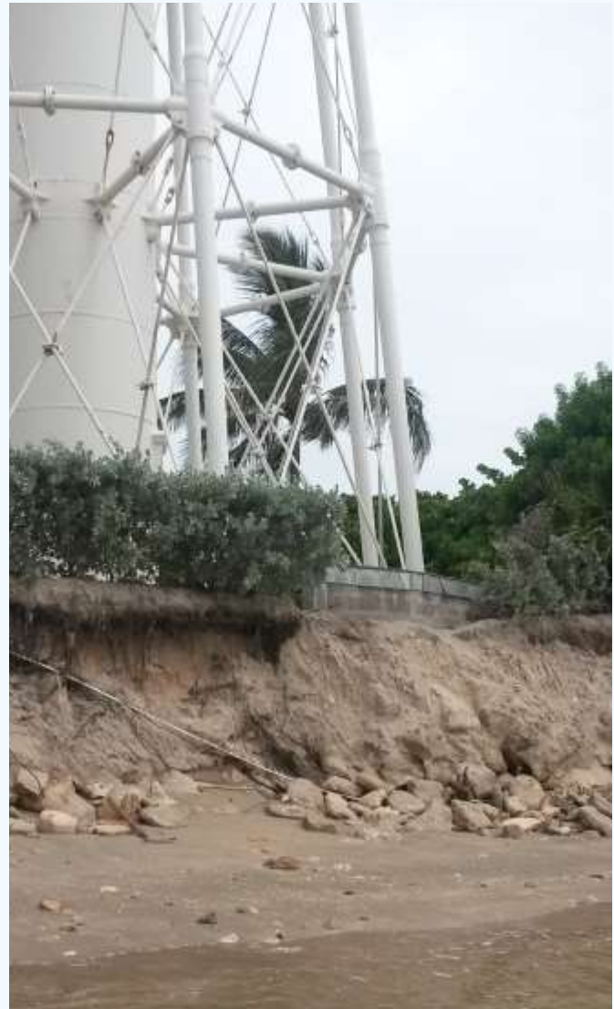
HLPS Shore Erosion, Sept. 28, 2015

The historic Hillsboro Inlet Lighthouse was built and commissioned in 1907 and has stood guard over the Hillsboro River Inlet in Broward County, Florida for 109 years. What makes this particular 145 foot tall lighthouse unique is it has the strongest light beam of all the other lighthouses in the United States. Its beam projects 28 nautical miles out to sea, and was placed on the