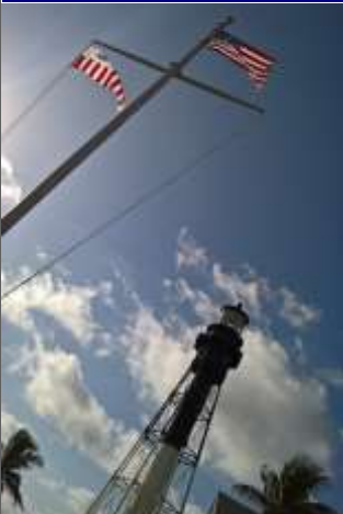
Flagpole & Hillsboro Lighthouse