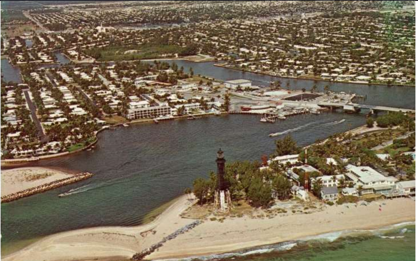
Hillsboro Lighthouse Aerial Photo Circa 1972

You as a member, volunteer or as a reader to this article can demonstrate your support for this and other projects by donating and contacting your County, State and Federal Government representatives.