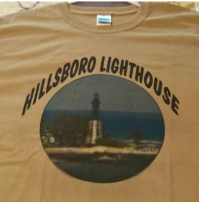
T-shirt of Hillsboro Lighthouse #2

http://www.hillsborolighthouse.org/store